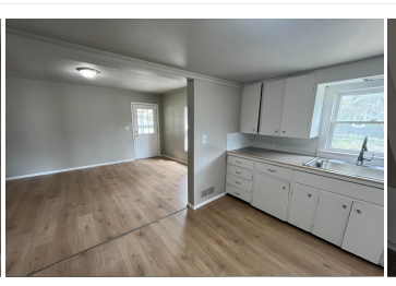
Heating: Gas Cooling: Window Air Taxes: $1,000