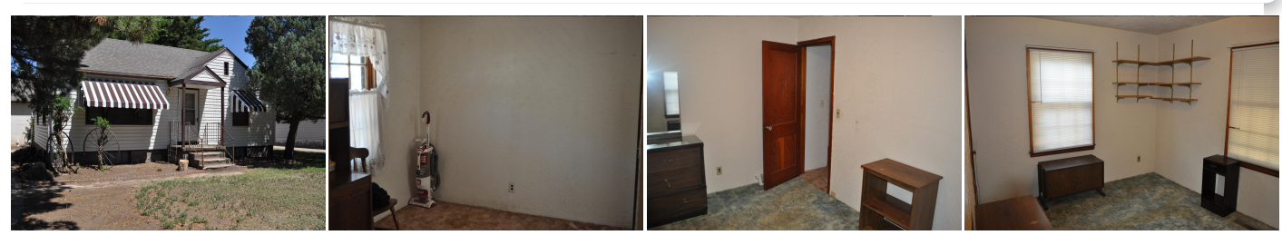
Type: Single Family Res. Style: Bungalow Year Built: 1946

Excellent location for this starter home offering 2 bedrooms on main floor, 1 bath, open living room and dining room and kitchen with all appliances. Full basement with 2 bedrooms, bath, family room and utility area with washer and dryer. Detached double garage with heated workshop. Large corner lot with lots of room.