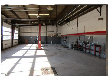
Heating: Electric, Gas Cooling: Central Air Refrig